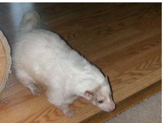
The first picture is Valdora at 23 pounds. The second picture is her now.

Valdora came to us 3 years ago at the age of 4. She had been with the same family since she was a baby, then all of a sudden the entire family developed allergies to her. They had the bright idea to breed her, so she was never spayed. She was 23 pounds when she came to us, so we couldn't spay her until she lost weight. It was 10 months before she lost enough weight for the surgery. Her ovaries were covered with cysts when they were removed. She probably wouldn't have lived much longer had she remained where she was. She wasn't able to walk for a few months until she lost enough weight for her legs to support her, but although her legs are now deformed, she walks and runs and begs like any other skunk.