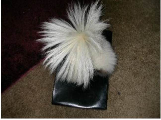
Topics discussed recently on Striped Bandits Skunk toys ~ Calcium and Taurine supplements ~ Skunk mischief ~ Tons of pictures!

If you would like to join the fun, you can apply to join our message board at: <a href="http://stripedbandits.proboards.com">http://stripedbandits.proboards.com</a>